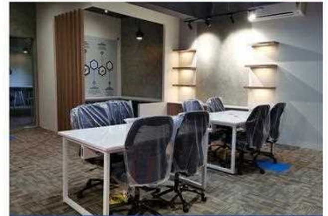
ROBOTICS & AUTOMATION CENTRE