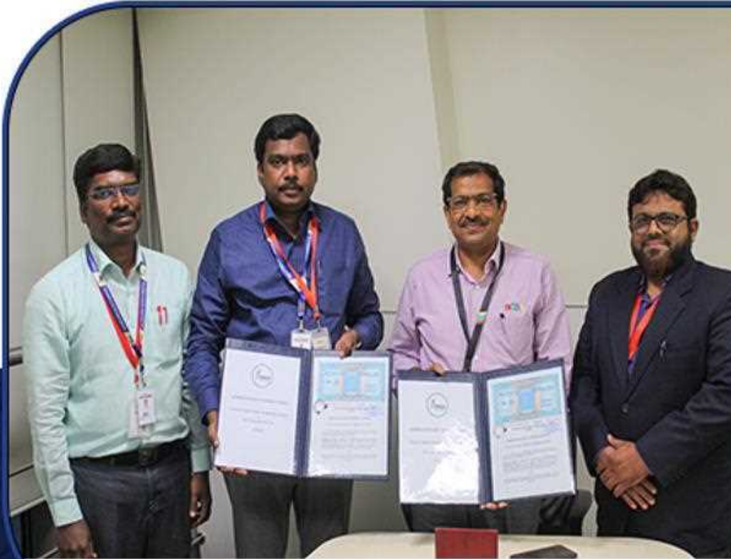
MOU with Zoho Corporation