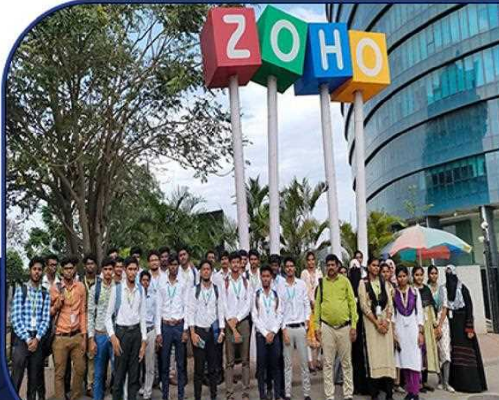
ZOHO- HOW TO WORK SMARTER