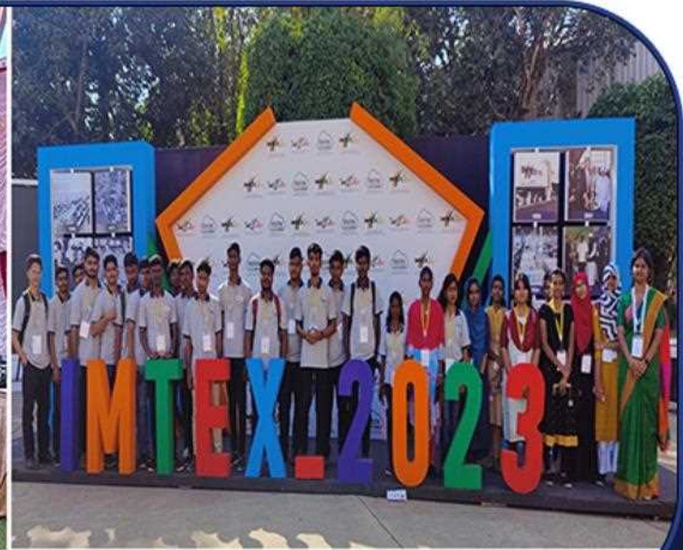
IMTEX-2023 @ BANGALORE