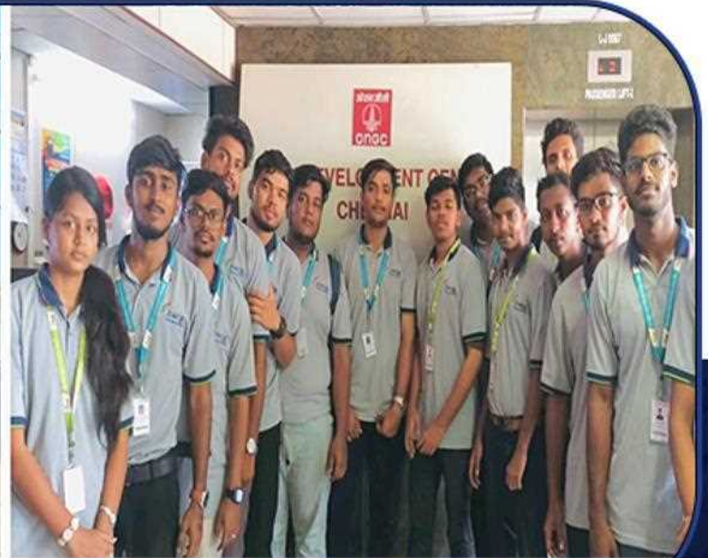
ONGC - INDUSTRIAL INTERNSHIP