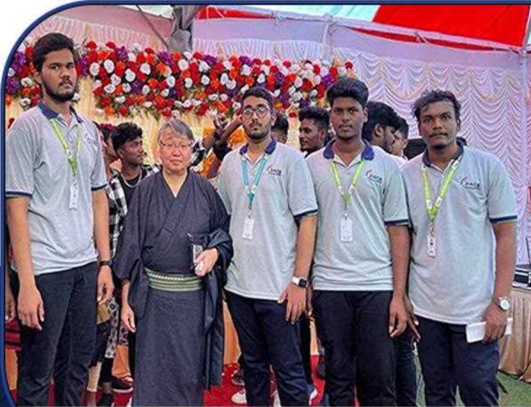
INDO - JAPAN EXPO - 2023