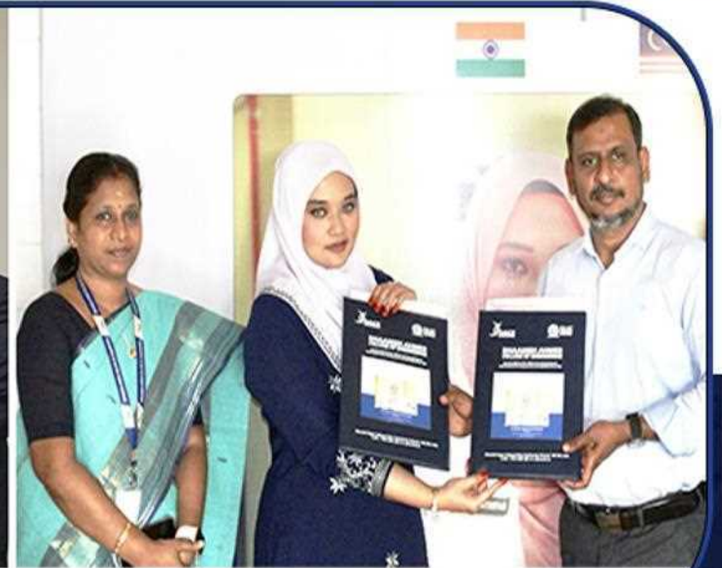
MOU with Universiti Teknologi, Malaysia