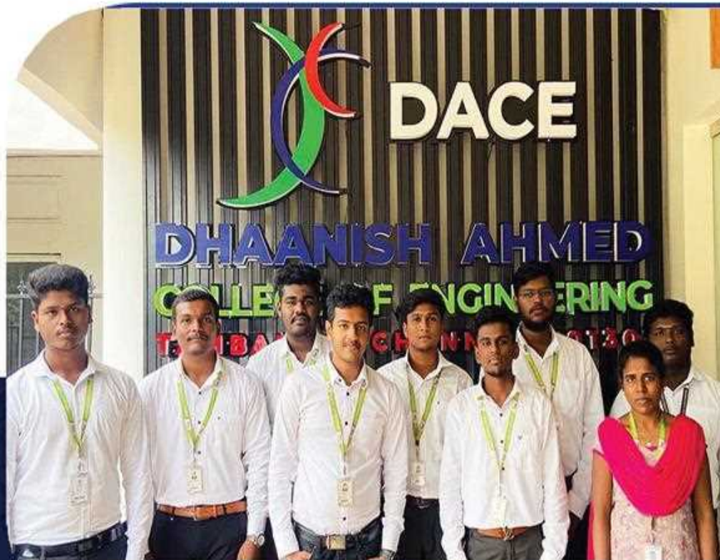
Subject:- FUNDAMENTALS OF ELECTRICAL ENGINEERING JULY - OCT 2023