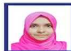
FIZA K CSE