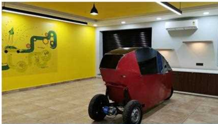
E - VEHICLE CENTRE