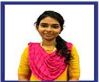
BHAGYA LAKSHMI ECE