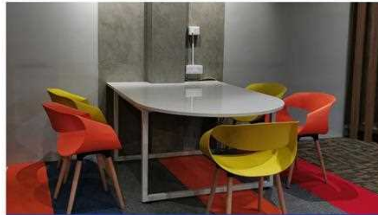
TECHNOLOGY RESEARCH INCUBATION CENTRE