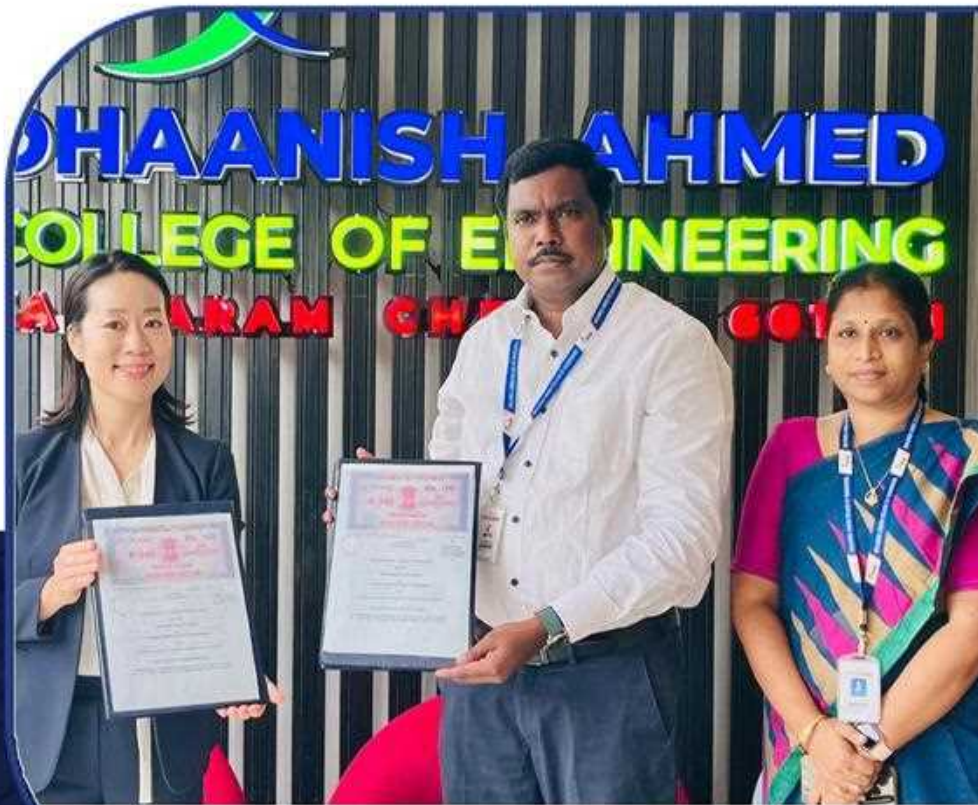
MOU with COGNAVI-JAPAN