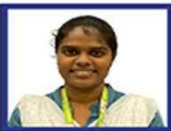
SUBHA M PETROLEUM