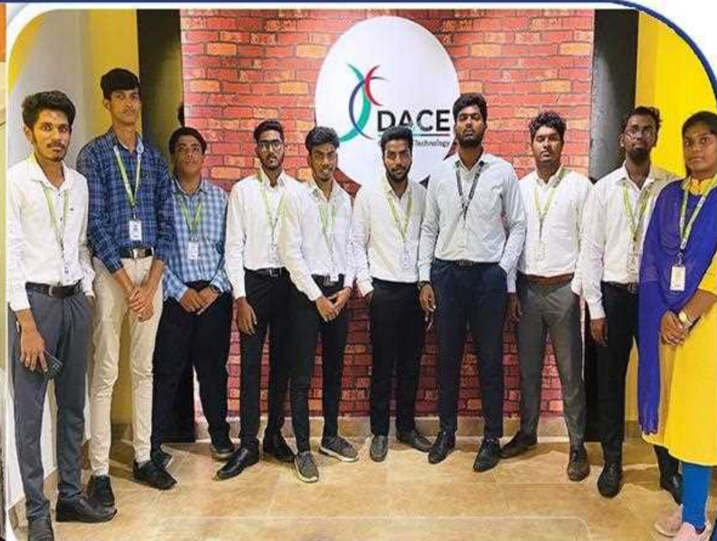
Subject:- BIG DATA COMPUTING AUG - OCT 2023