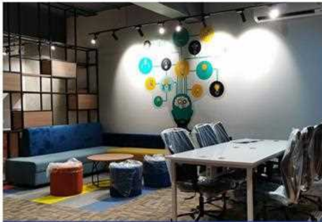
DHAANISH GREAT MASTERMIND