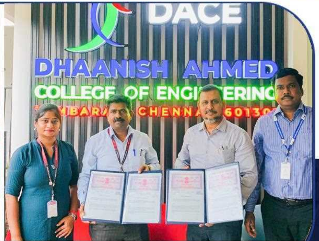
MOU with SEWAL SOFTWARES