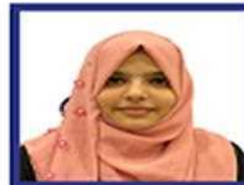
AFRA IMAN A ECE