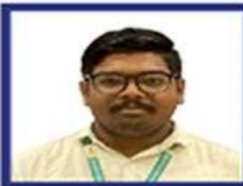
JOSEPH GEORGE PETROLEUM

MAGNIFICENT PLACEMENT PROMINENT RECRUITERS