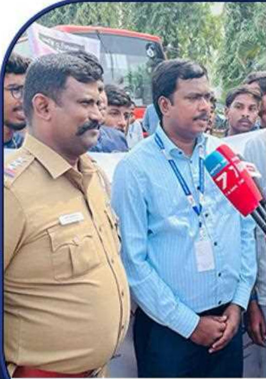
RALLY ON HUMAN RIGHTS AWARENESS